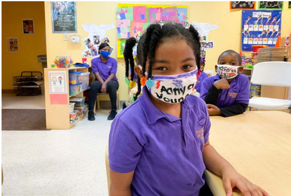
First Steps 4K, First Nazareth Child Development Center, Columbia

First Steps 4K offers curriculum-driven, full-day pre-K in private, nonprofit, and faith-based child care centers and schools. Teachers support early learning across multiple domains: learning and inquiry, physical development and motor skills, language and literacy, social and emotional development, and mathematical thinking.