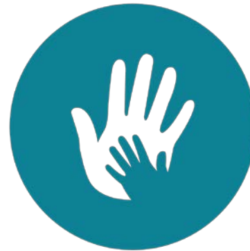
EARLY CARE & EDUCATION